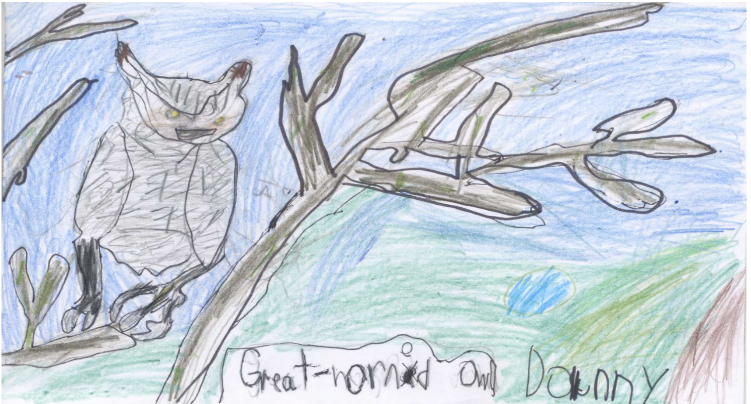
Great-horned Owl Danny

Hey, birders. I am a Great-Horned Owl. You might see me sleeping around the NYC parks today, or the East and/or Hudson Rivers. If you have a pest, like a moth, mouse, rat or skunk, just send it to me at night- they are all part of my prey. If you see a high nest with 2 or 3 eggs, and maybe sleeping, 2-foot-tall owls with long wings, ear tufts and brown bodies, it is probably me in my nest. I am a male, so my call is 4-5 hoots, when the call of my mate is 6-8 hoots. Uh-oh. It is a crow, my sworn arch enemy. They have come to attack me, so I will just eat them A.S.A.P. Bye!