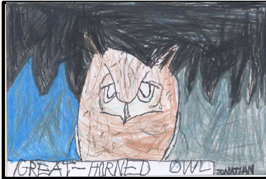
GREAT-HORNED OWL JONATHAN

Hey, birders. I am a Great-Horned Owl. You might see me sleeping around the NYC parks today, or the East and/or Hudson Rivers. If you have a pest, like a moth, mouse, rat or skunk, just send it to me at night- they are all part of my prey. If you see a high nest with 2 or 3 eggs, and maybe sleeping, 2-foot-tall owls with long wings, ear tufts and brown bodies, it is probably me in my nest. I am a male, so my call is 4-5 hoots, when the call of my mate is 6-8 hoots. Uh-oh. It is a crow, my sworn arch enemy. They have come to attack me, so I will just eat them A.S.A.P. Bye!